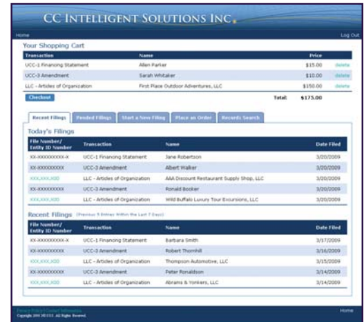
External Web User Home