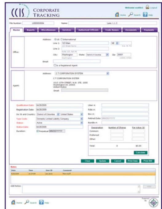
Back Office Entity Details